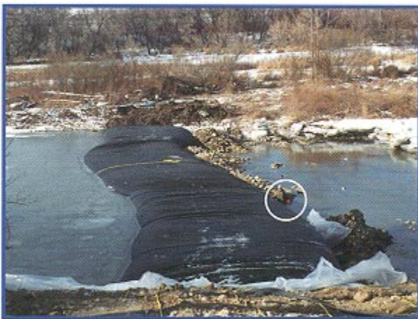
Grand River crossing in Brandford, Ontario (Canada).