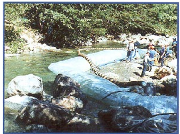
River diversion in British Columbia